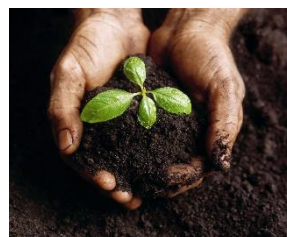
Soil with nutrients