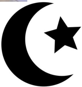
The symbol of Islam